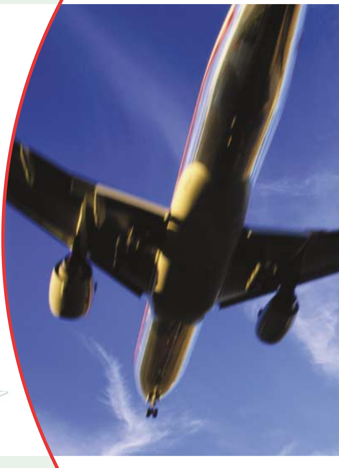
Sales Manager Airport Noise Monitoring Systems Brüel & Kjær Sound & Vibration Measurement A/S